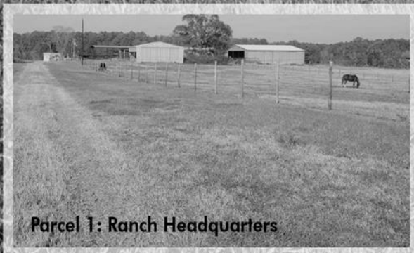
Parcel 1: Ranch Headquarters

Miles To: Houston 70, Montgomery 12, Richards 6, Conroe 32, Huntsville 20, Bryan 42 and College Station 35