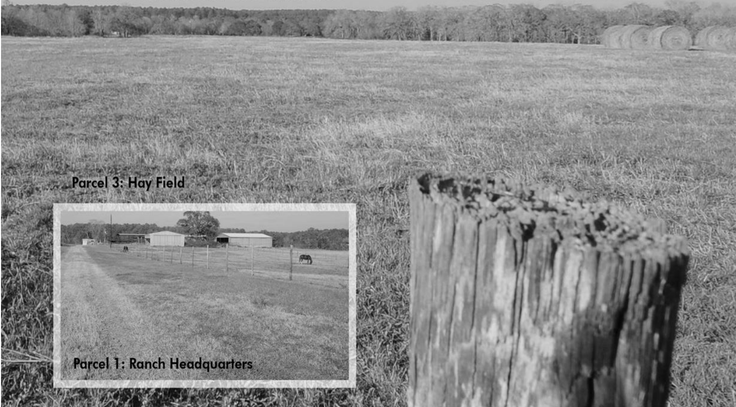
Parcel 3: Hay Field

OPEN HOUSE: April 12, 13, 14, 19, 20, 21, 26, 27, 11 a.m. to 6 p.m. to day of Auction. Auction Time: 3 p.m. on the 28th.