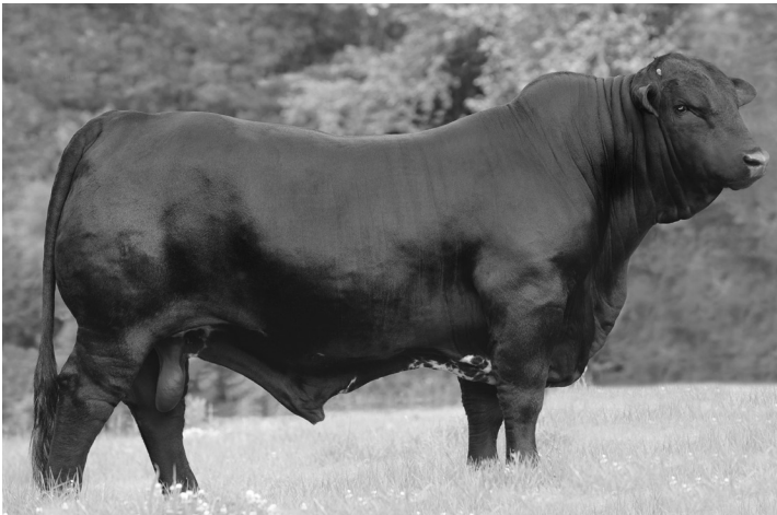
☆ Ring of Fire