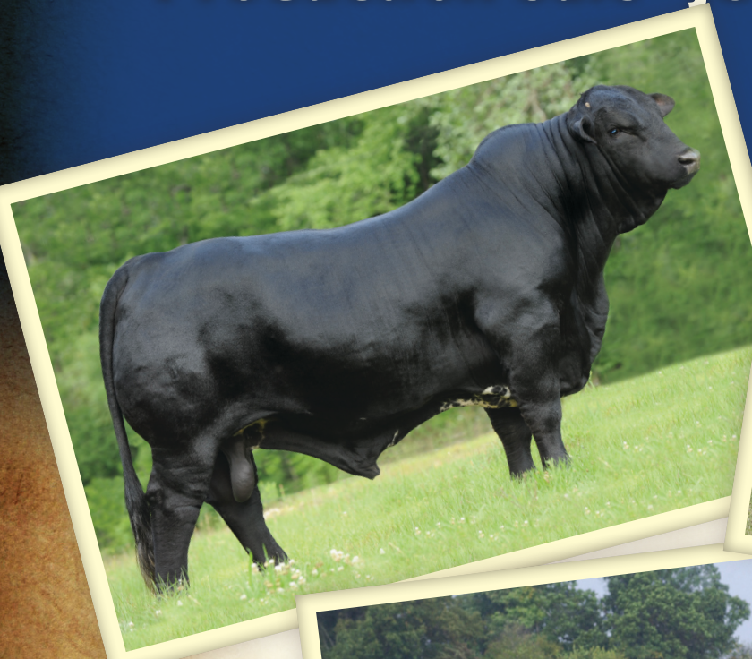
RING OF FIRE