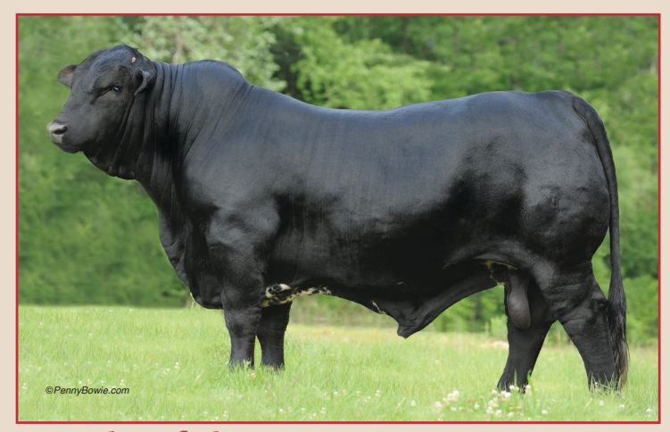
EMS Ring of Fire – Bonfire X Color Me Sugar Semen Selling - 2013 National Beefmaster Bull Championship Grand Champion.

Proven Donor Pair - One of the top Red Sugar daughters ever produced. A cornerstone donor. She will be a pair at the sale. Her 14-month-old polled son also sells.