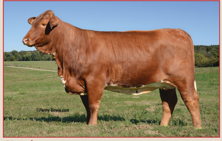
CJ 13/11 – Sugar Britches X Cavalier/Maiden Lady Incredible young donor prospect. Her sister also sells. 13/11 sells bred to Dr. Love.

Without question, one of the most influential cows in the history of the breed. 15 daughters and 10 sons sell. EPDs: BW -1.3/.91, WW +43/.89, YW +61/.86 Milk -3/.51, TM +18