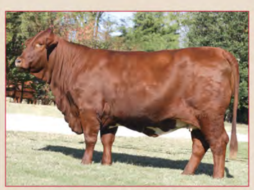
Desert Wine – Infinity X Red Red Wine. 2 sons by Sugar Britches sell!