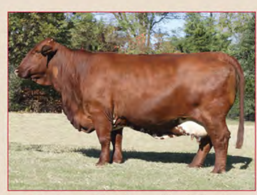
Madam Maiden – Hav A Dee X Maiden Lady. 2 sons by Sugar Britches sell!