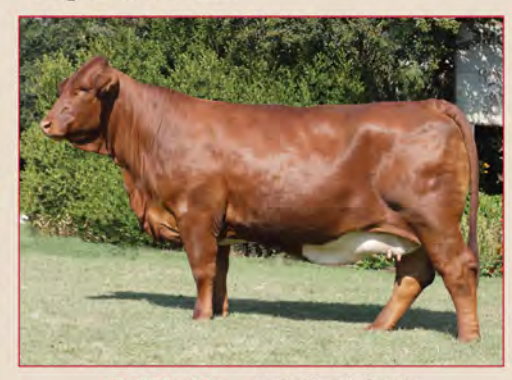
Déjà Vu – Infinity X Oasis. 3 sons by Dr. Love and Spartacus sell!

On June 22nd at the ranch in Jackson, Tennessee, Cottage Farm is proud to present The Bull Market . The Bull Market represents over 20 outstanding herd sire prospects that were all selected for these highly important traits: