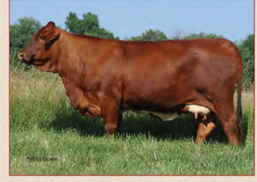
Bombshell – Spartacus X Sex Appeal. 3 grandsons by Adrenaline sell!