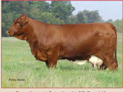
Oasis – **Cavalier X CF Sex Life. 12 sons by Captain Sugar, Infinity, Red Sugar, Synergy, Dr. Love and Sandman sell!