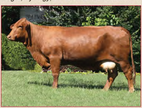
Lipstick – Infinity X Oasis. 2 sons by Spartacus sell!