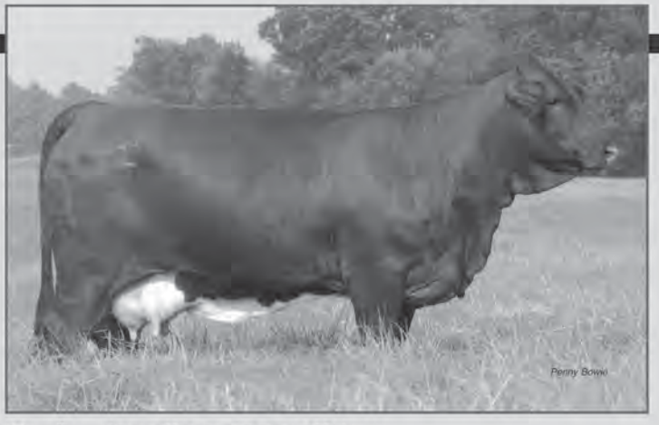
Oasis - (Cavalier X CF Sex Life)

SATURDAY, JUNE 22, 2013 • 10 A.M. at the Ranch • Jackson, Tennessee