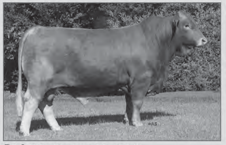
Dr. Love - (Spartacus X Sex Pistol)

Herd Sire - The premier Synergy son in the breed sells. Sells with 500 units of semen. Invaluable opportunity. DOB: 5/27/10, BW 69, 205 Adj Wt 660, 365 Adj Wt 1315, IMF 2.75, REA 15.4