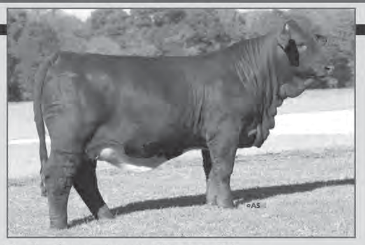
Oasis Clone - (Cavalier X CF Sex Life)

#1 (tied) ranked cow for weaning weight EPDs.