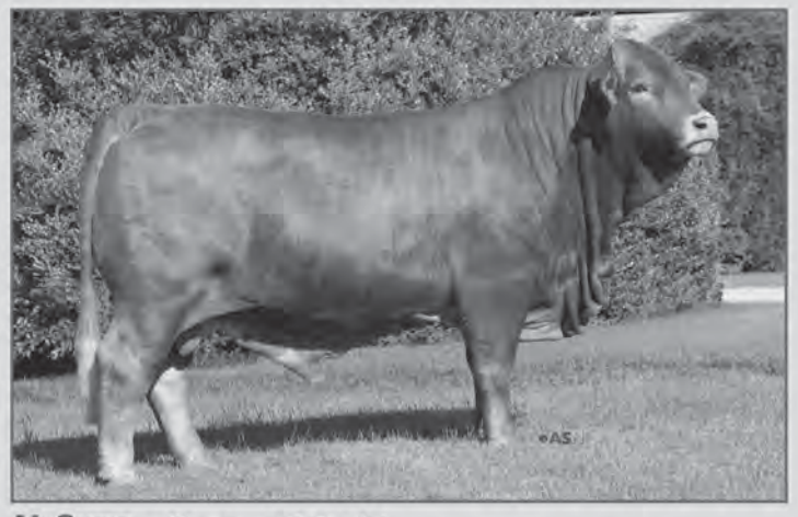
N-Sync - (Synergy X Oasis)

Donor Pair - Once-in-a-lifetime opportunity. Sells with a Dr. Love heifer calf at side. Her Infinity daughter also sells.