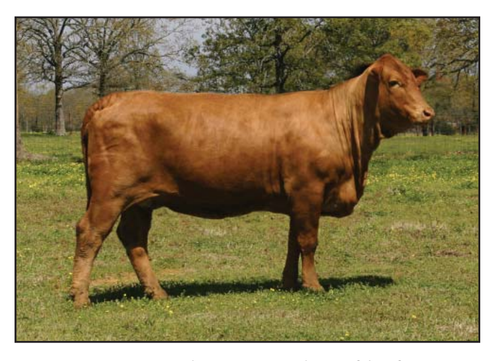
Lot 45 - Jungle Essence (dam of heifers)