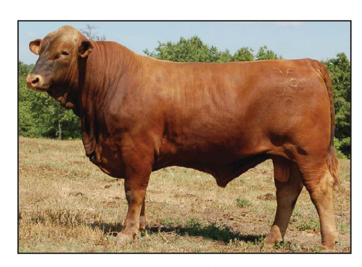
Lot 40 - Buckeye