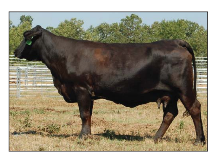
Lot 48 - Bull Creek 521