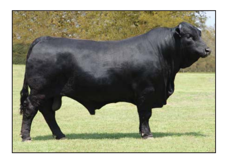
Lot 52 - TomKat