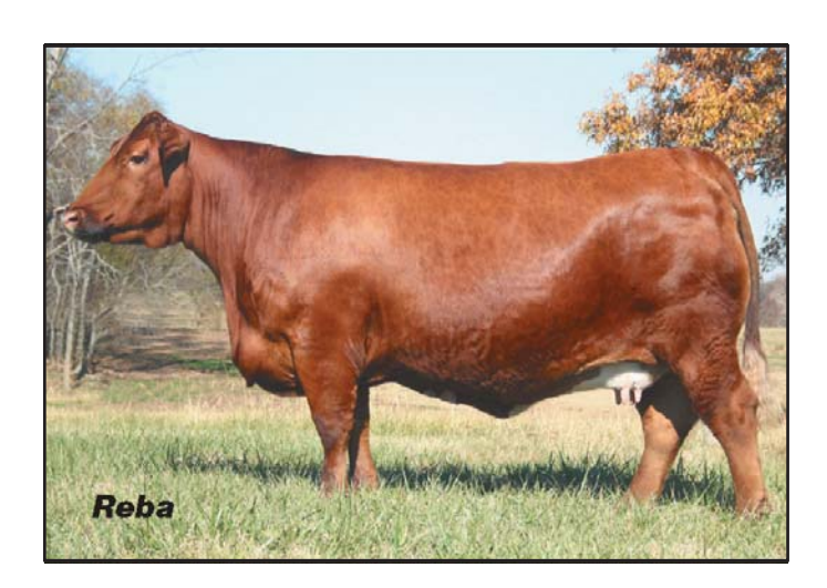
Lot 31 - CHRK Miss Reba (dam of CHRK BB Express)