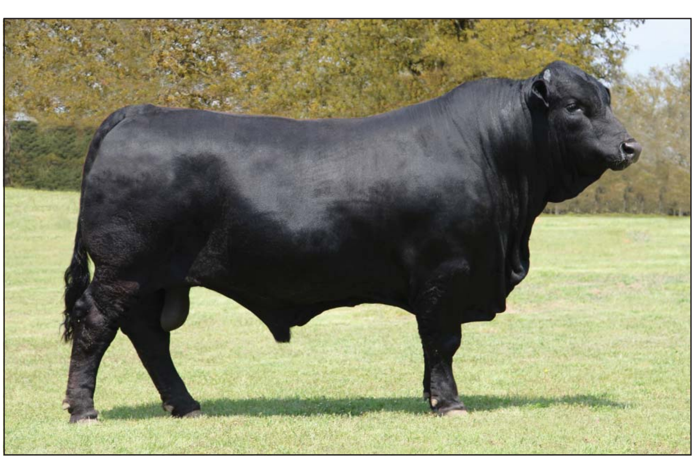
Lot 1 - TomKat