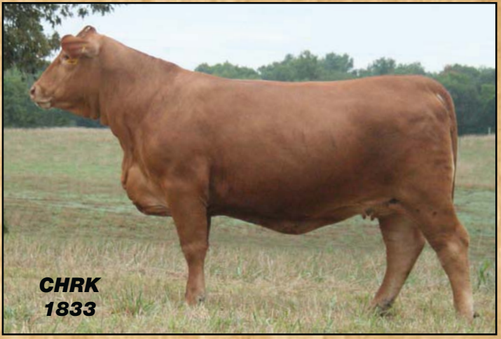
Doc 2D-0C81 x Miss Black Synergy. Sells bred to The Postman. Age 392, Wt 1025, REA 12.15, REA/SWT 1.20, IMF 2.03, Rib .35, Rump .43

The Southern Revolution offers the perfect mixture of futurity quality conformation, performance, and marketable genetics. You truly can have it all!