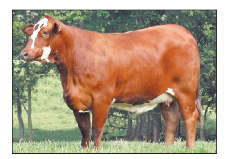
Lot 29 - Channarock 1710W