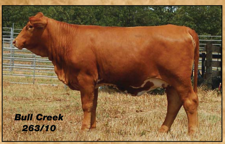
Zorro x 27T. Exposed heifer. Among the first to sell bred to Buckeye, our junior herd sire.