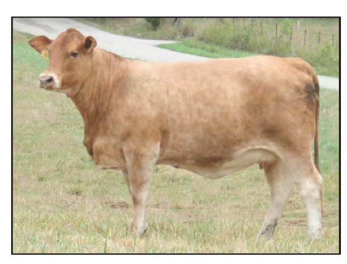
Lot 21 - CHRK Doc's Mattie