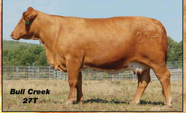
Black Jack 21 x Far & Away (Cavalier x By Far). Proven donor female selling heavy bred to our senior herd sire Tomkat.

The 2012 sale offering will feature the production of Channarock Farms, Bull Creek Cattle Co., Zeller Cattle Co., Kreger Beefmasters, Gator Farms and Kruse Farms