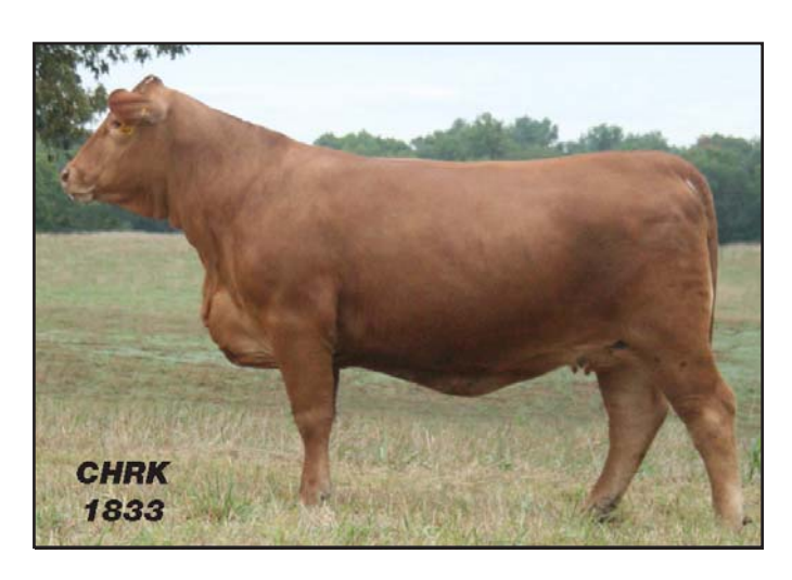
Lot 4 - CHRK Doc's Miss Synergy