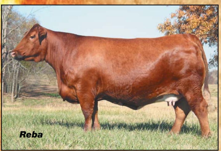
Selling a solid black herd sire prospect by CHRK Reba x Black Bayou. The only solid black full brother to CHRK Genesis offered by Channarock Farms.