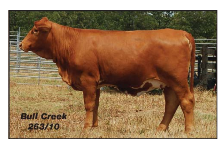
Lot 38A - Bull Creek 263/10

Gain test results: beginning wt. 688 lbs., finish wt. 888 lbs., total gain 200 lbs., average daily gain is an impressive 4.54 lbs. Pelvic score: 174 cm<sup>2</sup> on 5/3/12.