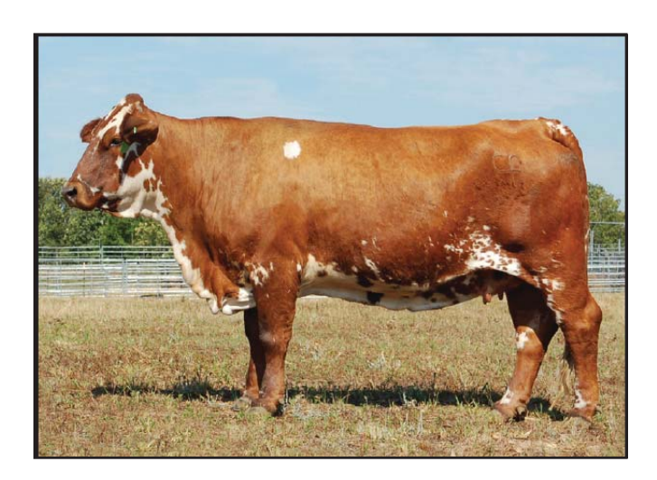
Lot 58 - Cottage Farm 100