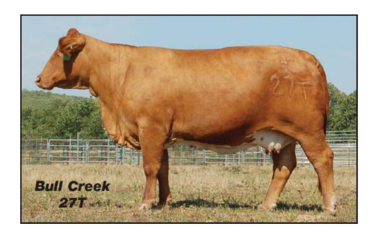
Lot 35 - HCC Ms. 27T