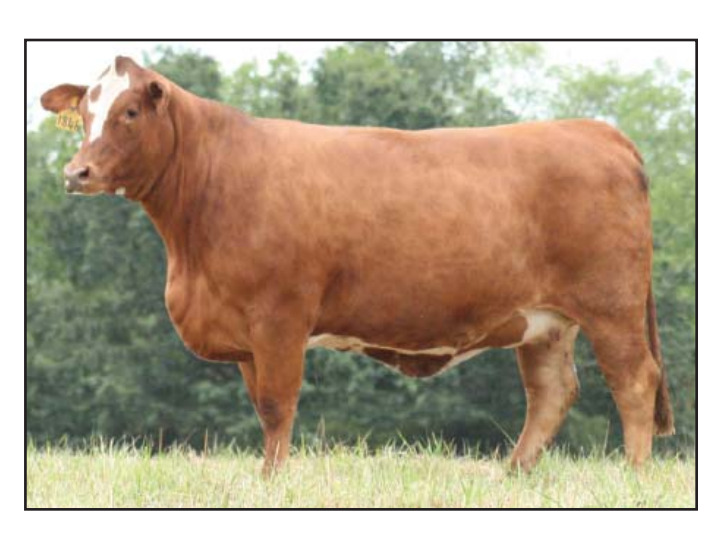
Lot 11 - CHRK Doc's Kiffer

This is a fancy female going back to Mo-Jo on the bottom side. Study her conformation. She is deep sided and angular, making her the perfect Beefmaster female. Study her performance; she has a second to none scan and awesome EPDs as well. 1846X sells bred to calve in the fall. Calfhood vaccinated.