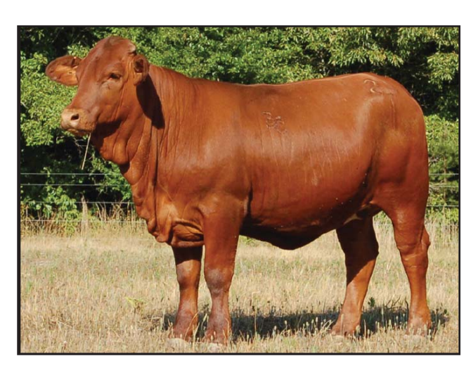
Lot 42 - Bull Creek 29/11