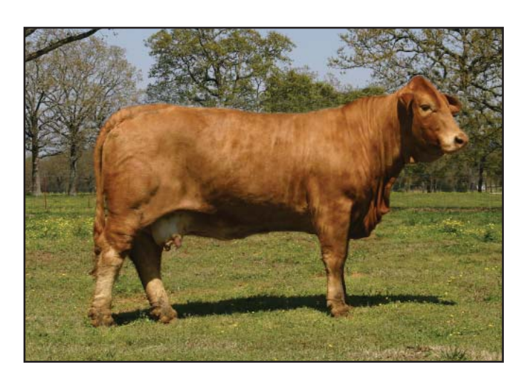
Lot 43 - Futura (dam of 2/10)