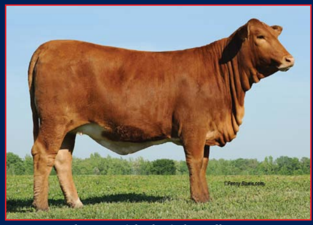
JT 612 - (Jackpot X Wicked Witch). Sells open.