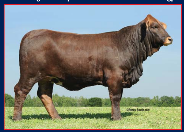
JT 2911 - (Painted Tiger X Hillary). Sells bred.