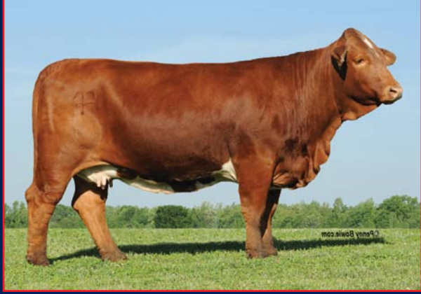
Hillary - (Infinity X Oasis) Excellent Painted Tiger and Jackpot daughters sell along with 3 Painted Tiger bulls and embryos out of Painted Tiger and Spartacus. She sells bred to Kingpin.