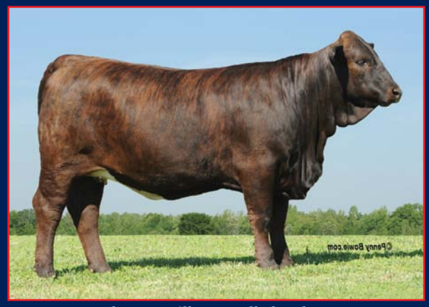
JT 3911 - (Jackpot X Hillary). Sells bred.