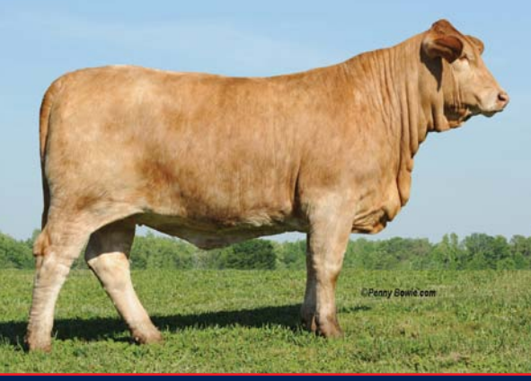
JT 43 - (Painted Tiger X Wicked Witch). Sells open.