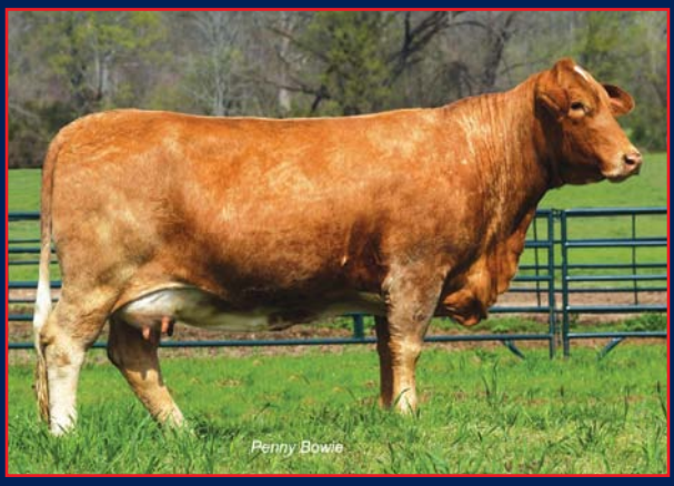
Wicked Witch - (Cavalier X Witchy Woman) This is the largest offering of Wicked Witch progeny to sell. Three Painted Tiger, 2 Jackpot, 1 Motown, 1 Xcite, 4 Captain Sugar, and 1 Sugar Britches sell.