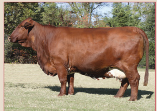
Madam Maiden – Hav A Dee X Maiden Lady. 2 sons by Sugar Britches sell!