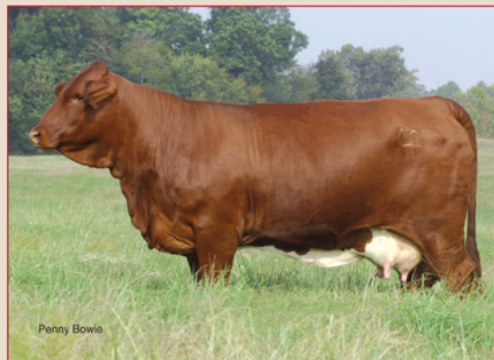
Oasis – **Cavalier X CF Sex Life. 12 sons by Captain Sugar, Infinity, Red Sugar, Synergy, Dr. Love and Sandman sell!