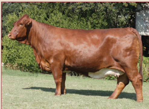
Déjà Vu – Infinity X Oasis. 3 sons by Dr. Love and Spartacus sell!

As with any INVESTMENT decision, it is important to understand the basis of the INVESTMENT . The sires of these prospects include Sugar Britches, Sugar Bear, Adrenaline, Captain Sugar, Synergy, Dr. Love,