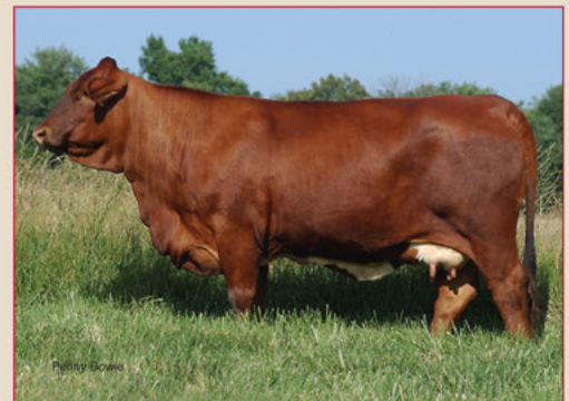
Bombshell – Spartacus X Sex Appeal. 3 grandsons by Adrenaline sell!