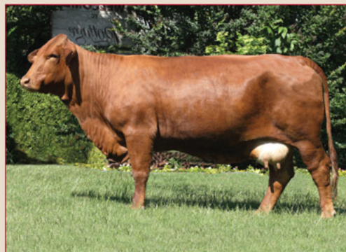
Lipstick – Infinity X Oasis. 2 sons by Spartacus sell!