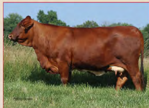
Bombshell – Spartacus X Sex Appeal. 3 grandsons by Adrenaline sell!