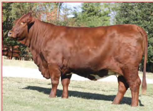
Desert Wine – Infinity X Red Red Wine. 2 sons by Sugar Britches sell!