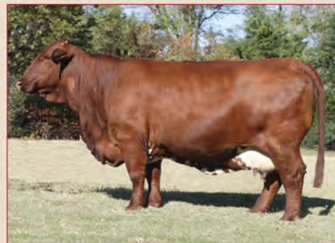
Madam Maiden – Hav A Dee X Maiden Lady. 2 sons by Sugar Britches sell!