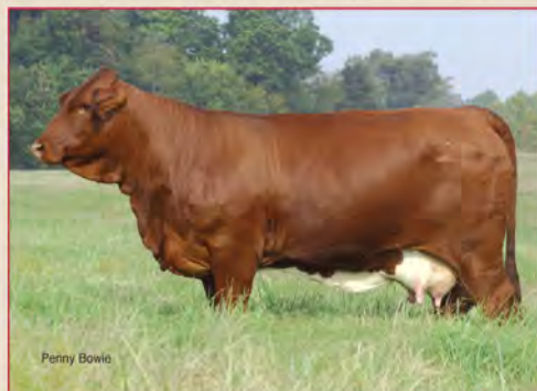
Oasis – **Cavalier X CF Sex Life. 12 sons by Captain Sugar, Infinity, Red Sugar, Synergy, Dr. Love and Sandman sell!