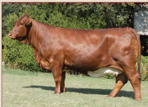
Déjà Vu – Infinity X Oasis. 3 sons by Dr. Love and Spartacus sell!

As with any INVESTMENT decision, it is important to understand the basis of the INVESTMENT . The sires of these prospects include Sugar Britches, Sugar Bear, Adrenaline, Captain Sugar, Synergy, Dr. Love,