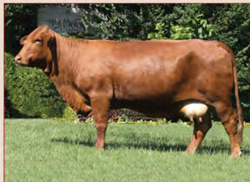
Lipstick – Infinity X Oasis. 2 sons by Spartacus sell!