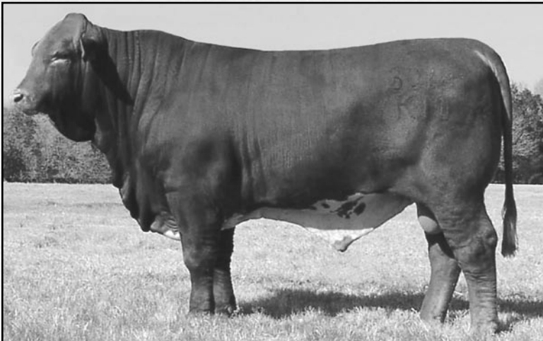
Tabasco 3018K10 BBU: C821734 Birth: 3/13/2000 Classified U Blood Type 7091A Semen offered in Lot 72C