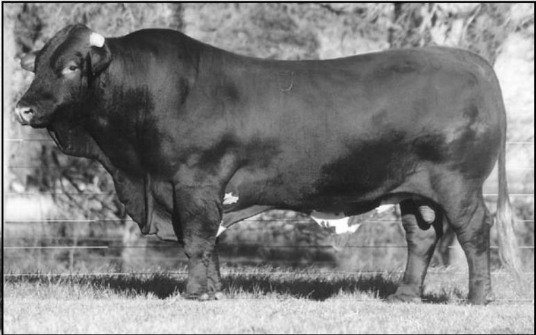
007 BBU: C823650 Birth: 1/1/2000 Classified U Blood Type: 8866A Semen offered in Lot 72D