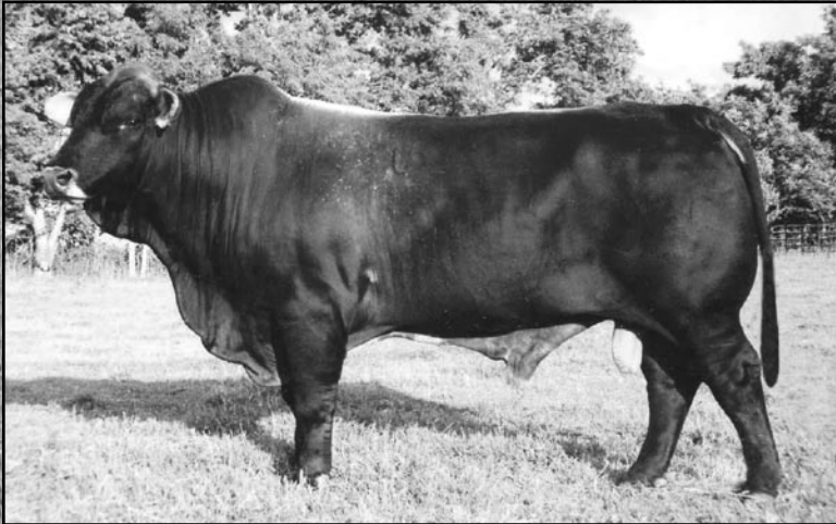
Tiger II 8127 BBU: 769942 Birth: 1/27/1998 Classified U 1, 2 Blood Type: 7163A