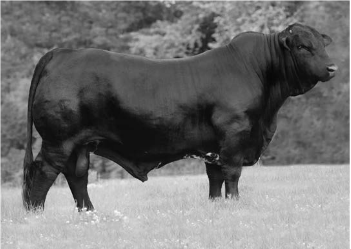
EMS RING OF FIRE