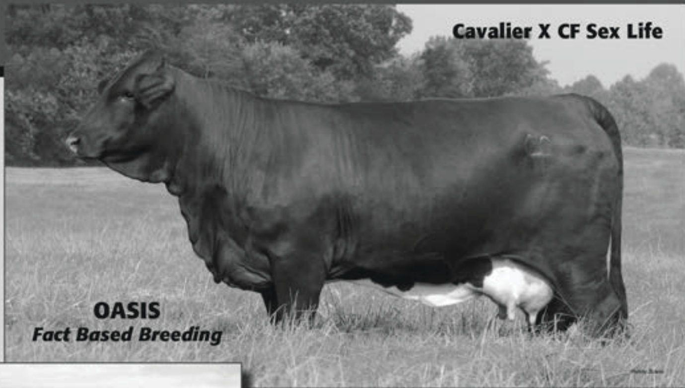
OASIS Fact Based Breeding