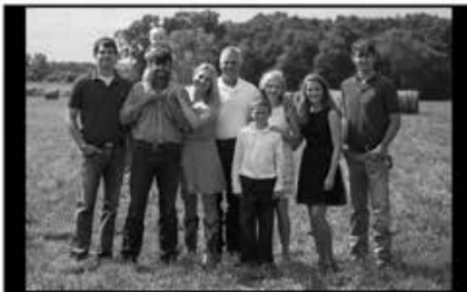
BJR Summerford Family