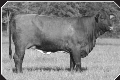
BROWN SUGAR Spartacus x 6072 (Sandman x Sugar Ann) Selling progeny.