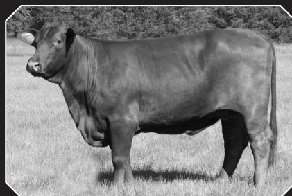
CARMELITTA 1605 Cavalier x Carmenett Selling progeny.

Technology • Experience • Communications