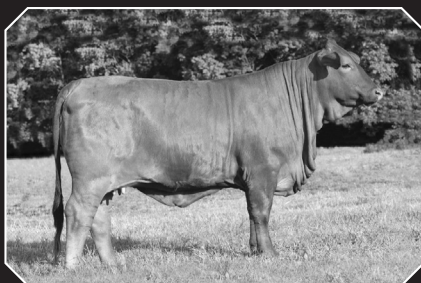
PROMISE KEEPER 40/07 Spartacus x Farrah's Promise Selling progeny.