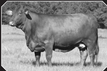
CAPURNIA 19/02 Spartacus x Red Farrah Lady Selling progeny.