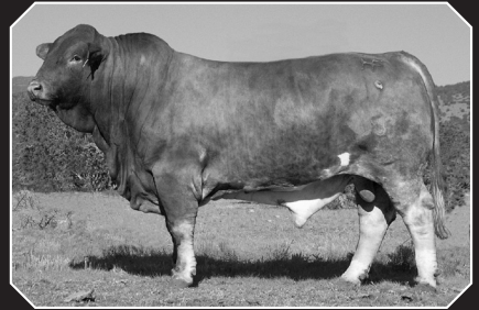
CAVALIER ID# 19/5 | BBU: C617557 Classified: U 1/2 11/96 DNA: 302A | BT: 5679A

ID# 1054 BBU: C1016885 Captain Jack x Carmelitta DNA: US400097675