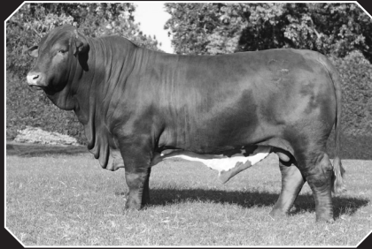
COTTAGE FARM - SUGAR BRITCHES ID# 040 | BBU: 940465 DNA: 345274A