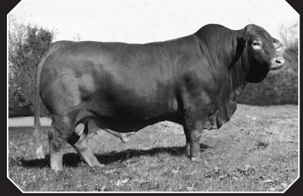
COTTAGE FARM - ADRENALINE ID# 170 | BBU: C965778 DNA: US3000940PV