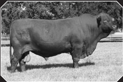
CAPTAIN JACK ID# 43/7 | BBU: 947413 Classified: U 1/2 2/09 DNA: US4039456PV