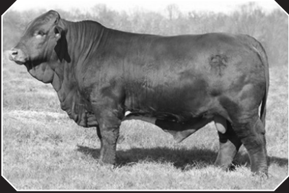
COTTAGE FARM - DREAMCATCHER ID# 914 | BBU: C977250 DNA: US3000924PV