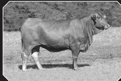
PRECISELY SUGAR 100/05 Synergy x Totally Sugar Selling progeny and a flush to bull of your choice.