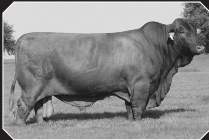
SYNERGY ID# 84/95 | BBU: C615710 Classified: U 1/2 1/97 DNA: 183A | BT: 5779A